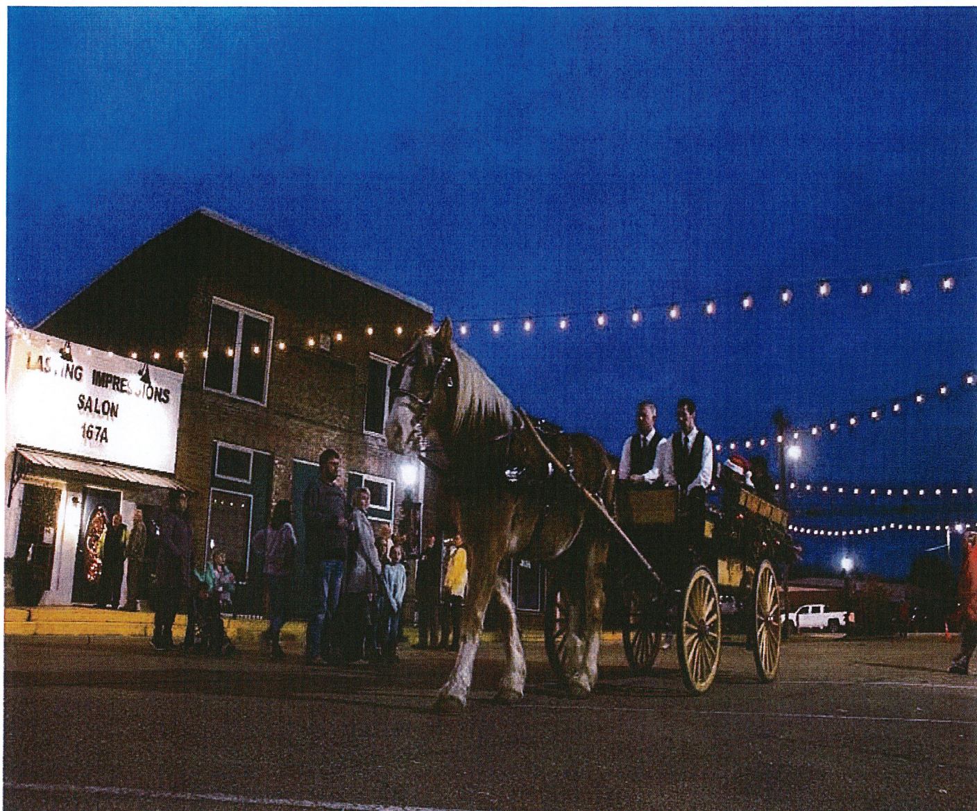
Main Streets Light Up Nettleton Event. Carriage Rides downtown.