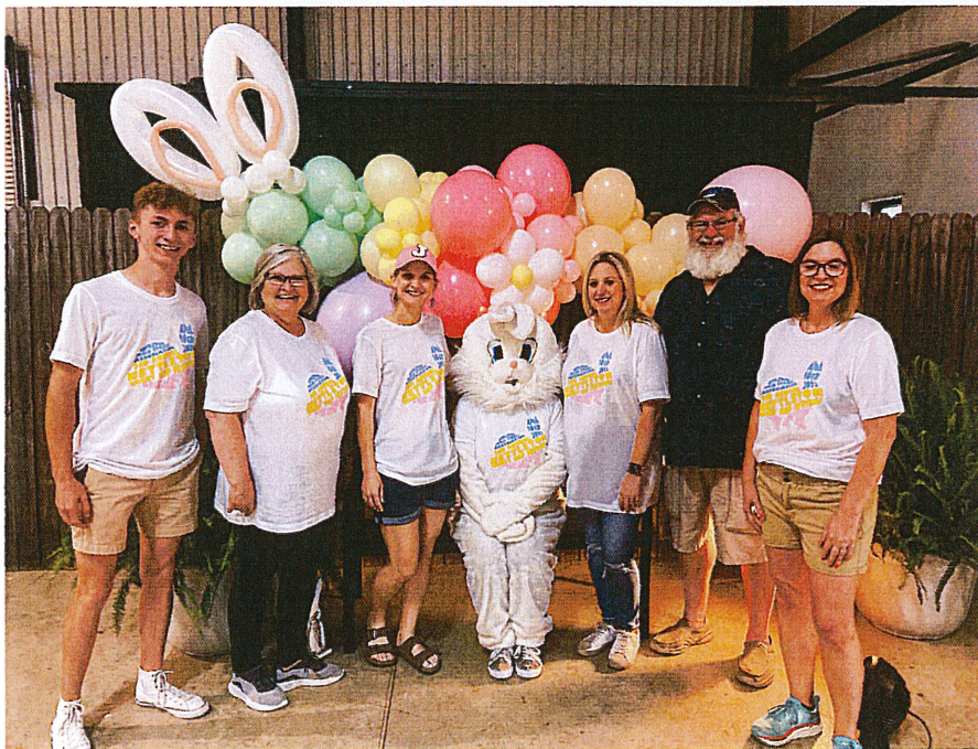
Bunny Hop Festival with 3k. Pics made with Easter Bunny