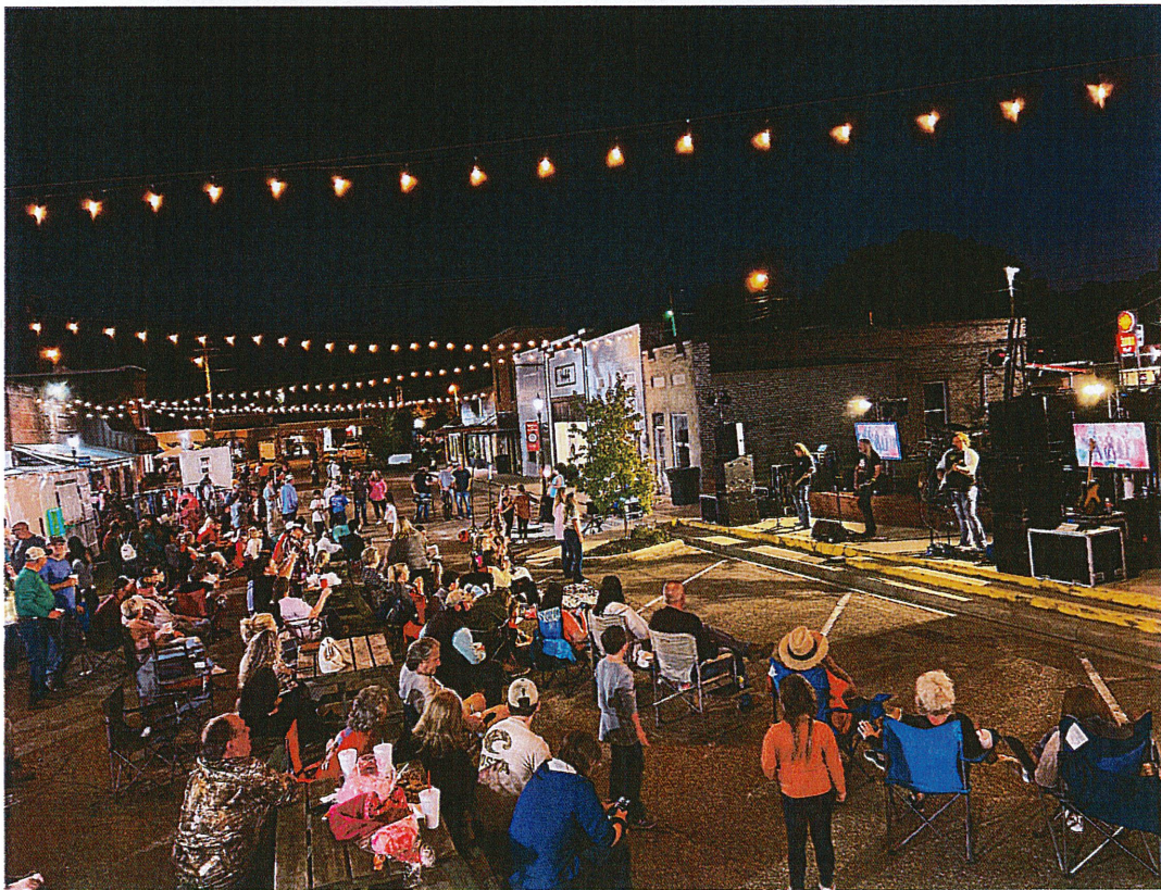
Town Creek Festival and Ms. Town Creek Pageant.