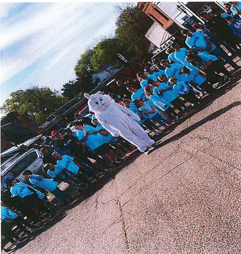
Bunny Hop Festival and 3K