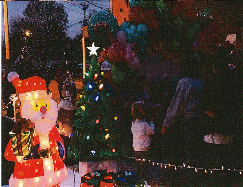
Main Streets Light Up Nettleton Event. Pics with Santa. Lighting of the Tree and Carriage Rides.