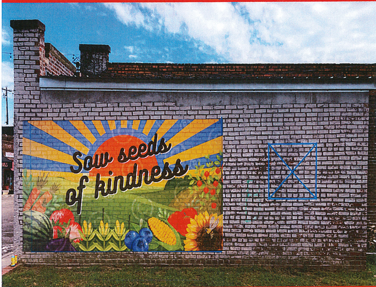
Restoration of Historic Barber Shop Mural.