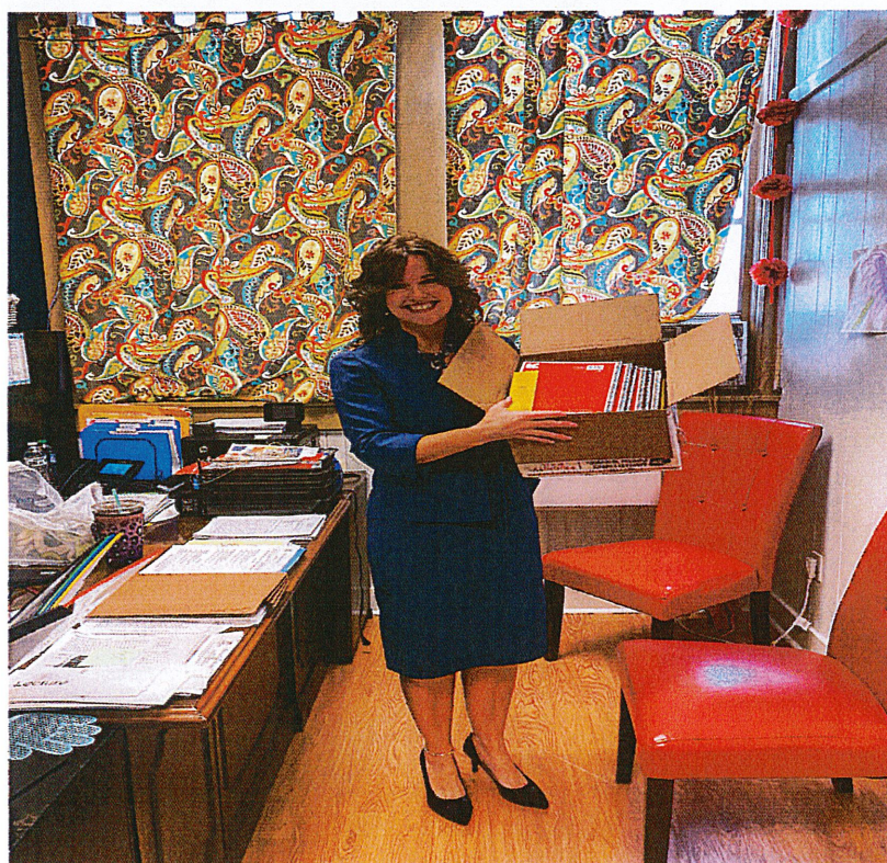
Back to School Bash. Supplies given to Nettleton School District.