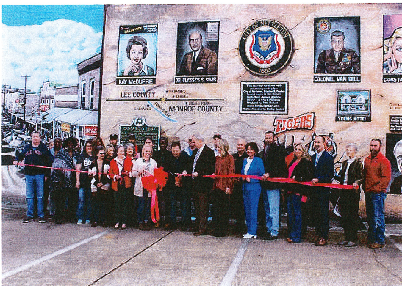
Mural Dedication on Library Building.