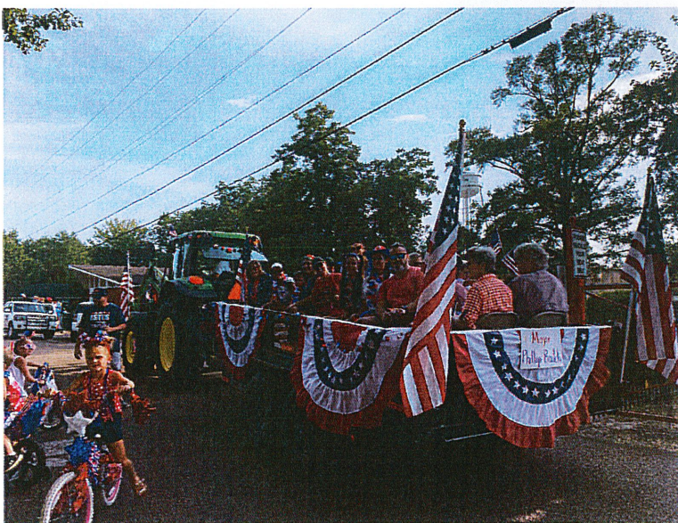
Fourth of July Pa- rade and Fireworks in the Park.