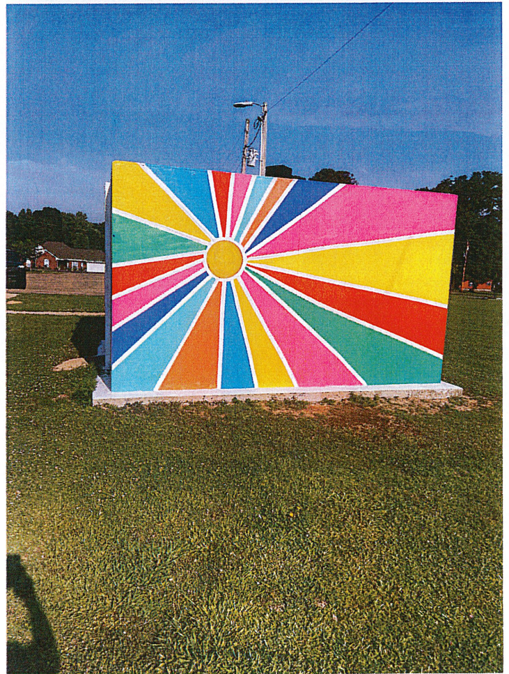
Storm Shelter Mural Project. Kids painted handprints.