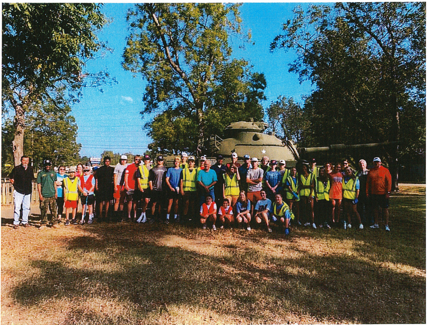
Nettleton Clean Up Day in Conjunction with keep MS. Beautiful. Mayor, Board, Main Street and School Academic Programs participated.