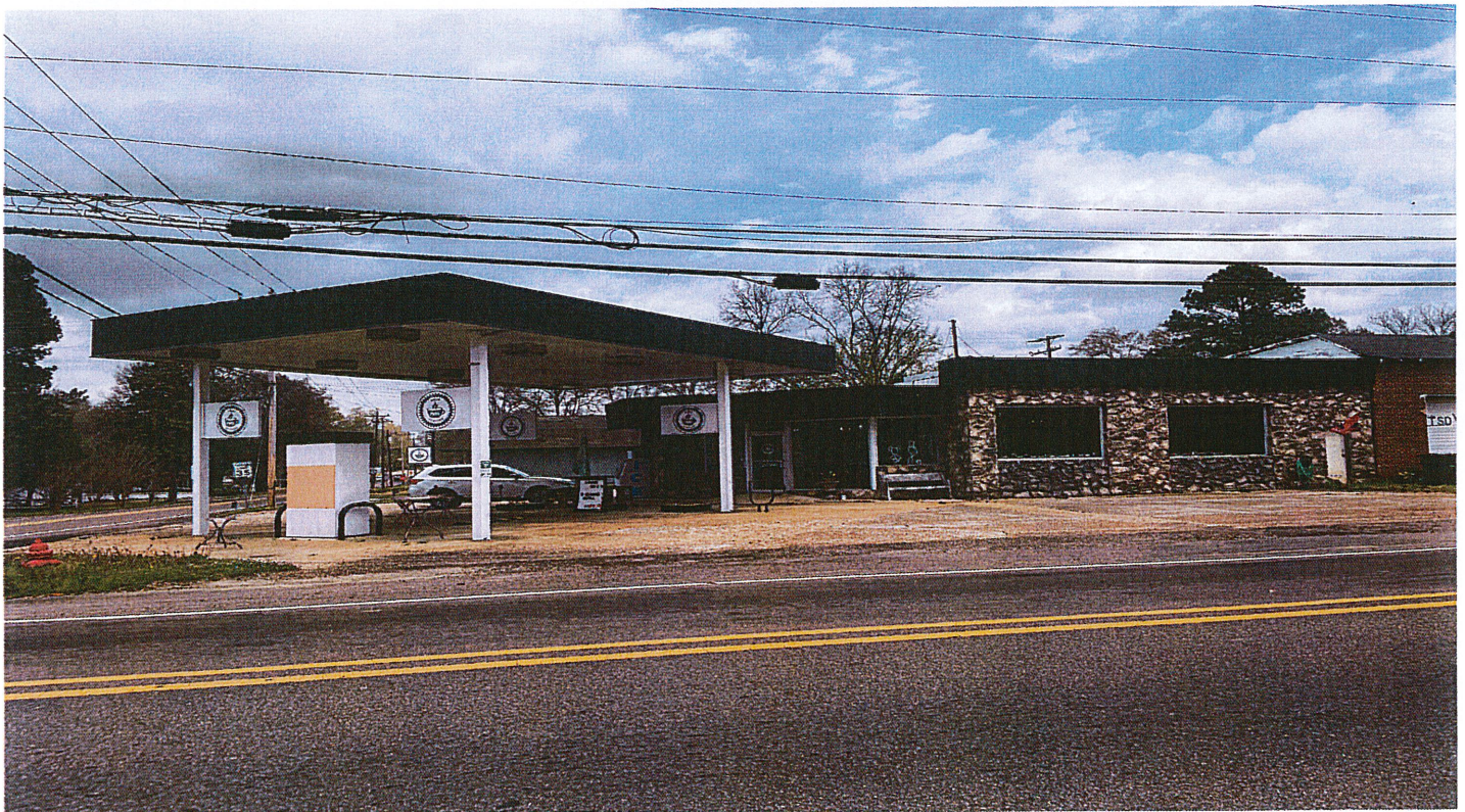
Before and after pics of Façade Grant. Pure Brew Gas Station converted to a Coffee Shop. (Called Pure Brew Coffee Shop)